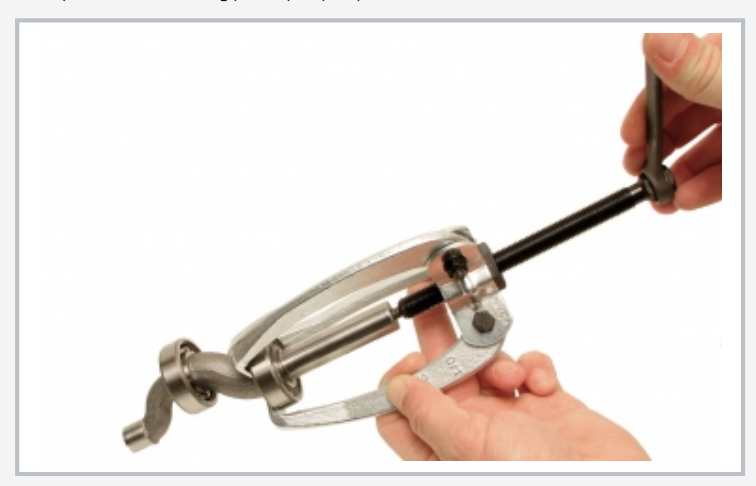
Dissassembly of the piston pump: pulling off the ball bearing of the eccentric shaft (using a bearing puller)